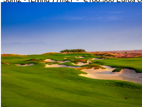
EDIFICIO MARGARITA_Planta Tercera "X" | Fortuna

Block MARGARITA: 1st Floor (Lucia No 3 & 4) - 2 Bedrooms - 2 Bathrooms - Terrace 38m2 - (Living 77m2) - €188.900 Euros completion September 2025