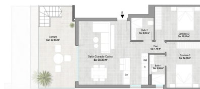
EDIFICIO MARGARITA_Planta Tercera "B" | Fortuna