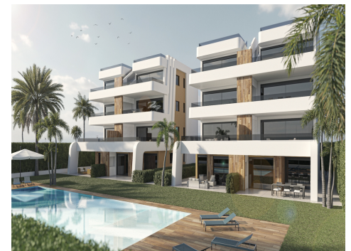
EDIFICIO MARGARITA_Planta Solarium "B" | Fortuna

Todos los datos son estimados. El propietario se reserva el derecho a introducir modificaciones por razones técnicas o legales.